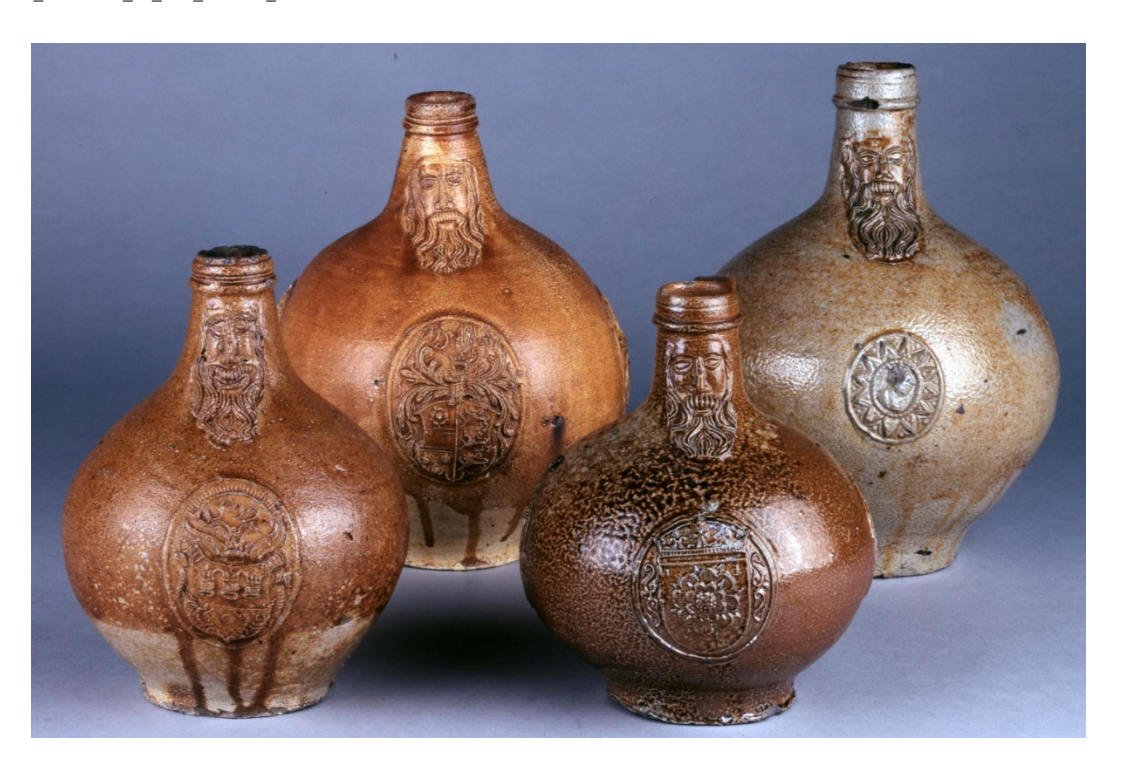
Fig. 6. Rhenish Stoneware. Bartmann/Bellarmine jugs.