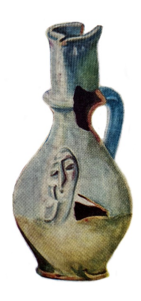
Fig. 14. Bartmann jugs' fragments. Narikala Fortress. After Mitshishvili 1974: plate VIII.