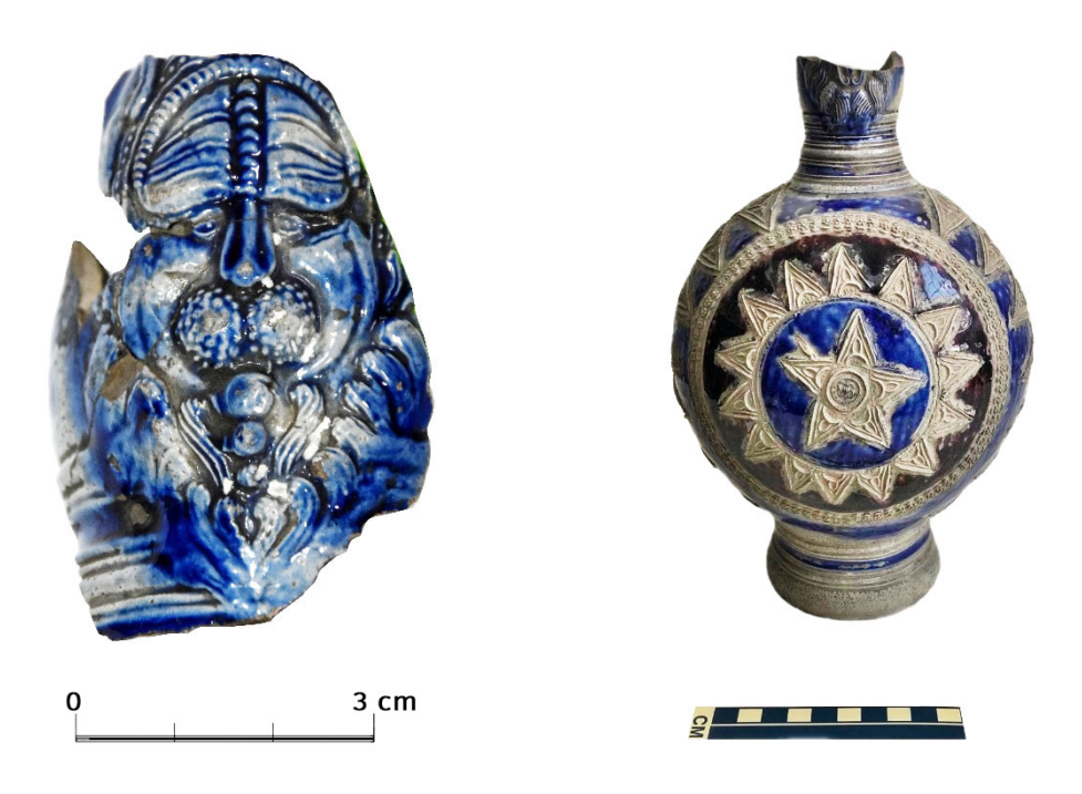
Fig. 22. Pitcher with the coat of arms of Anselm Franz von Ingelheim, Archbishop-Elector of Mainz After Hinton 2012: plate 20