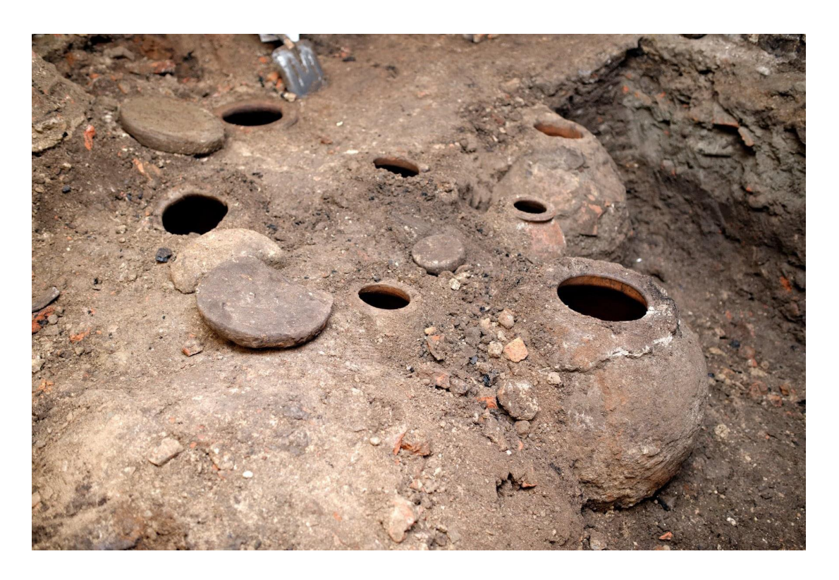
Fig. 2. Discovery of the vessels in wine cellar. 'Treasure' hidden in Kvevri.