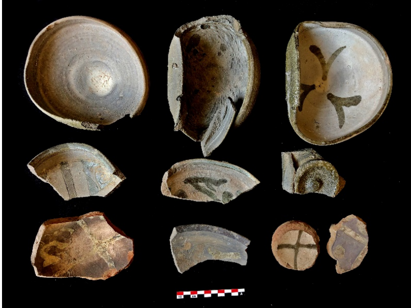
Fig. 9. Defective pottery from the dumped deposit next to the kiln. Gudiashvili Square N7/2