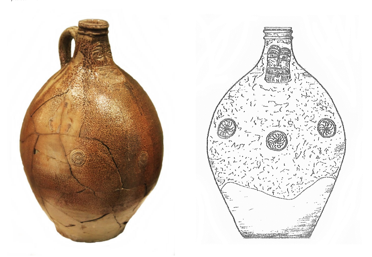
Fig. 17. Fragments of a brown salt-glazed Bartmann jug from Akhospireli street N2/4 Gudiashvili Square.

Drawing by David Mindorashvili after Mindorashvili 2008: plate. XVI.