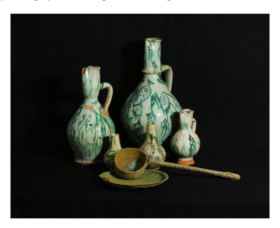
Fig. 4. Bartmann jug's fragments found nearby the cellar in the basement of Gudiashvili Square N7/2 (restored by Nino Kamkamidze).