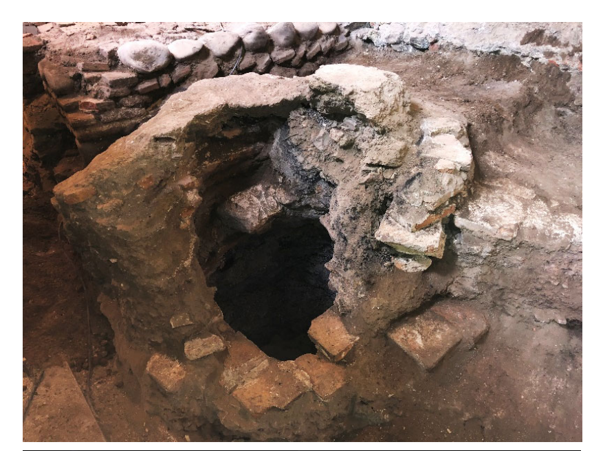
Fig. 8. Ceramic kiln remains from the Gudiashvili Square N7/2 basement (yet unstudied in very details).